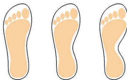
Straight Semi-curved Curved

MIDSOLE - The layer of cushioning and stabilizing material between the outsole and the upper. The mid-sole typically consists of either ethyl-vinyl acetate (EVA), Polyurethane, or a combination of both. Often there's a dual density midsole that has firmer material on the inner portion of the foot to help limit pronation (rolling in) of the foot. A Post or footbridge (firm material along the arch side of the midsole) may be added to increase stability.